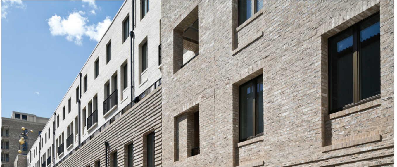
HAWORTH TOMPKINS ARCHITECTS AND KEITH HUNTER

Behind a beautiful façade, a significant contribution is made by fixings and fasteners. Innovations in nickel-containing stainless steel fixing products are helping to accelerate the rate of construction and reduce build costs.