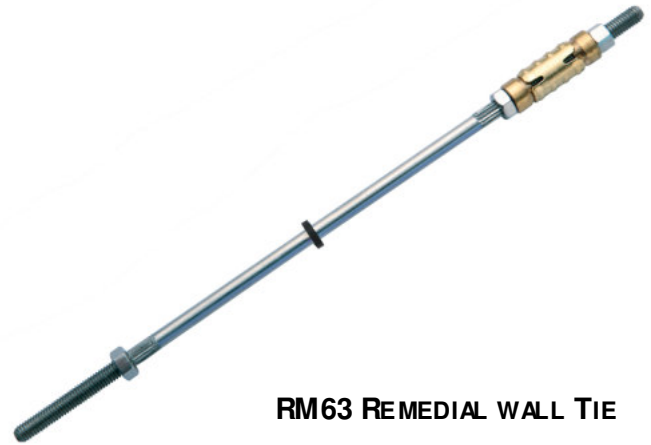
RM63 REMEDIAL WALL TIE

Note. Test results are a mean of 5 tests