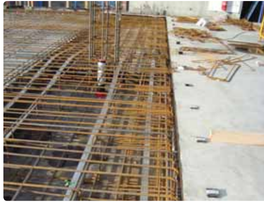
Ancon lockable dowels installed at temporary movement joints on the new Royal Children's Hospital, Melbourne.