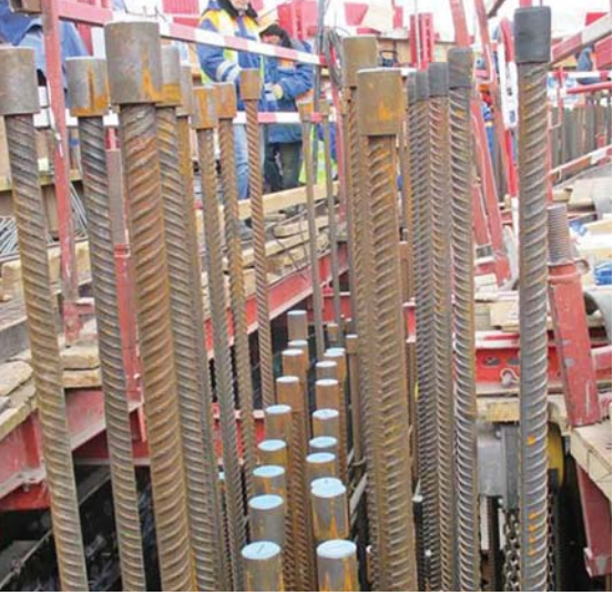
CXL Type B coupler.