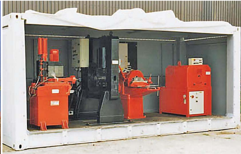
CXL bar threading facility.

In this method, one of the bars to be joined is threaded for a full coupler length, which allows the coupler to be rotated from this position to the second fixed bar to make the splice. These Type B slices are ideal where it is difficult to rotate the reinforcing bars and were a significant advantage in this instance due to the length and weight of the reinforcement.