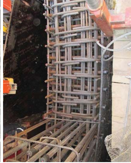
Connections between outriggers and central core.