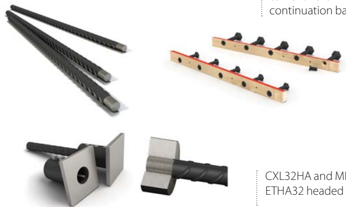
CXL32HA and MBT ETHA32 headed anchor.

Shearfix CXL studs feature an anchor head formed at the end of a length of reinforcing bar using a special hot-forging and quenching process. The other extremity of the stud is fitted with a CXL coupler, enabling connection with a threaded continuation bar to be cast in the second-phase concrete.