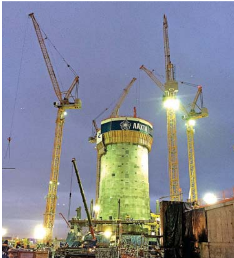
Slipforming of central reinforced concrete core.