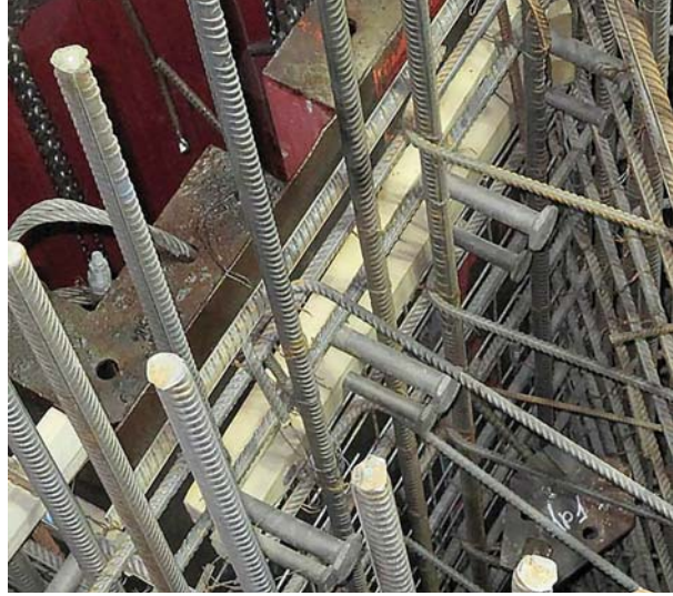
KSN connections between floor slabs and central core.